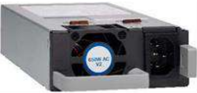
Figure 14. 650W AC power supply (C9K-PWR-650WAC-R)