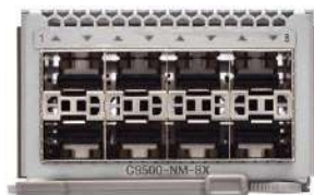
Figure 10. Cisco Catalyst 9500 Series network module 8-port 1/10 Gigabit Ethernet with SFP/SFP+

The following figures show the available network modules