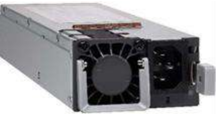
Figure 15. 1600W AC power supply