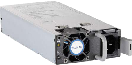
Figure 16. 650W AC power supply (C9K-PWR-650WACL-R)