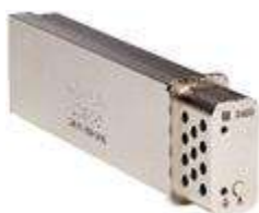
Figure 12. 240-GB SSD storage

The following figure shows the 240-GB SSD storage.