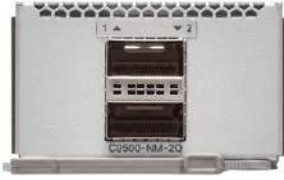
Figure 11. Cisco Catalyst 9500 Series network module 2-port 40 Gigabit Ethernet with QSFP+