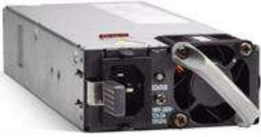
Figure 13. 950W AC power supply

The following figures show the power supplies available for the Cisco Catalyst 9500 Series